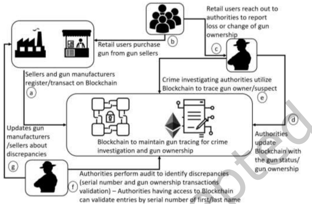
Figure 1: Gun Ownership and Tracing Smart Contract Architecture